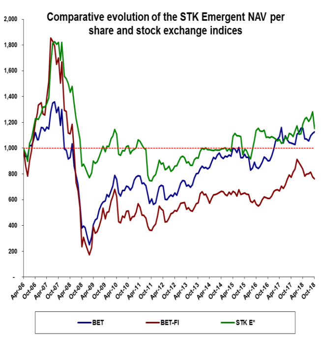
STK E*- NAV per share adjusted for dividends

Comparative chart of STK Emergent and the Bucharest Stock Exchange Indices between start-up and October 2018: